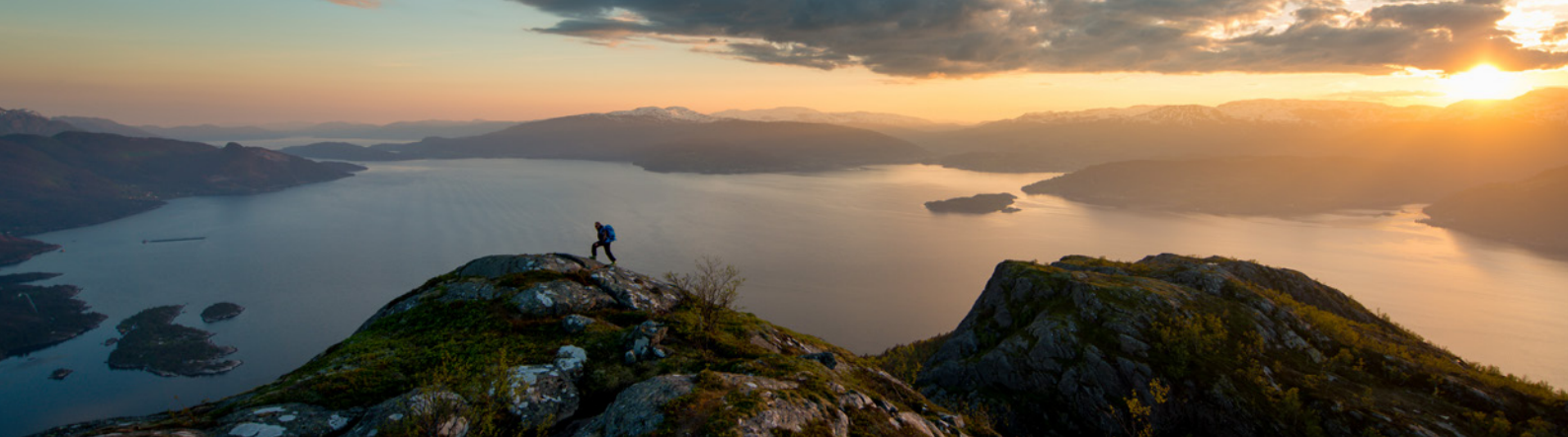
Midsummer late evening view from Mt Samlen.