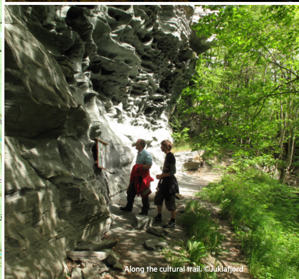
Along the cultural trail.