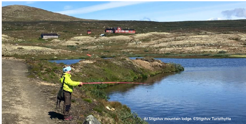
At Stigstuv mountain lodge.