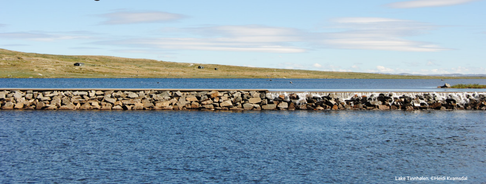
Lake Tinnhølen.

- excellent hike with kids into Hardangervidda National Park